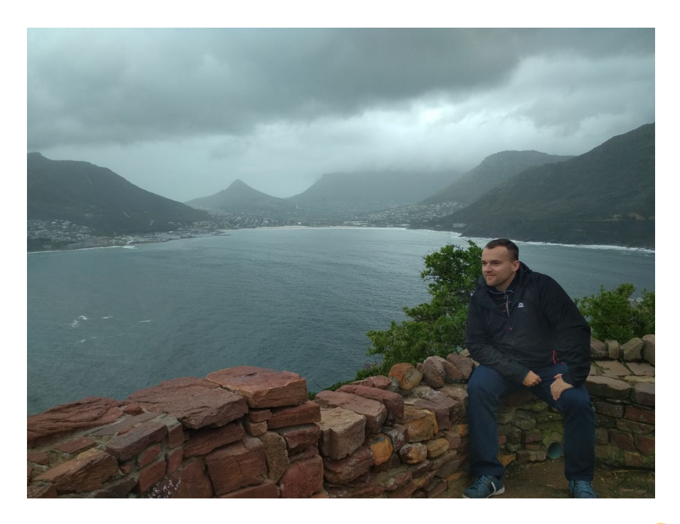
Although the weather was often moody, I was always in a good mood! 😃