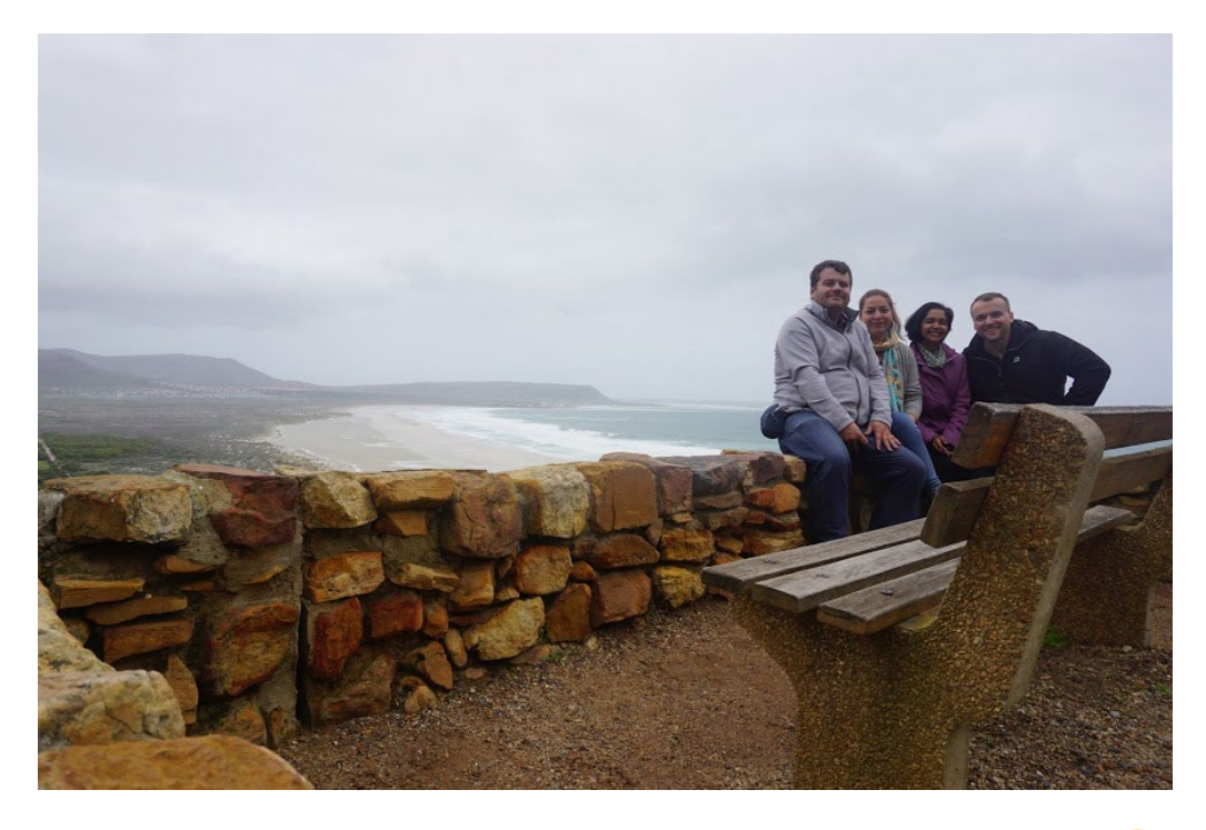
We also stopped to take a picture of the biggest and longest beach in CT! \stackrel{ ext{$arphi}}{ ext{$arphi}}