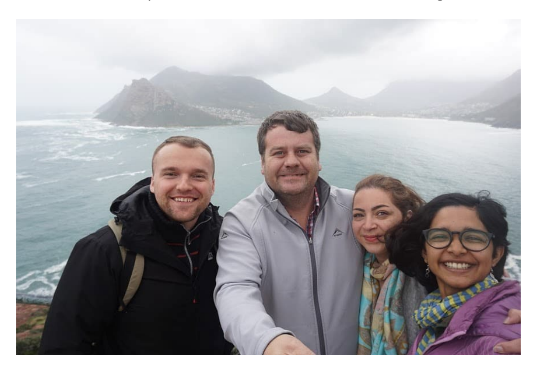
As you can see on our faces, we were having 24 a good time! \stackrel{ ext{$arphi}}{ ext{$arphi}}