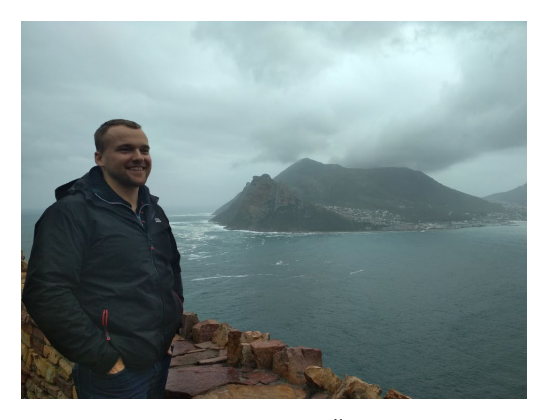
In Hout Bay, there's a fantastic view of 23 the surroundings!