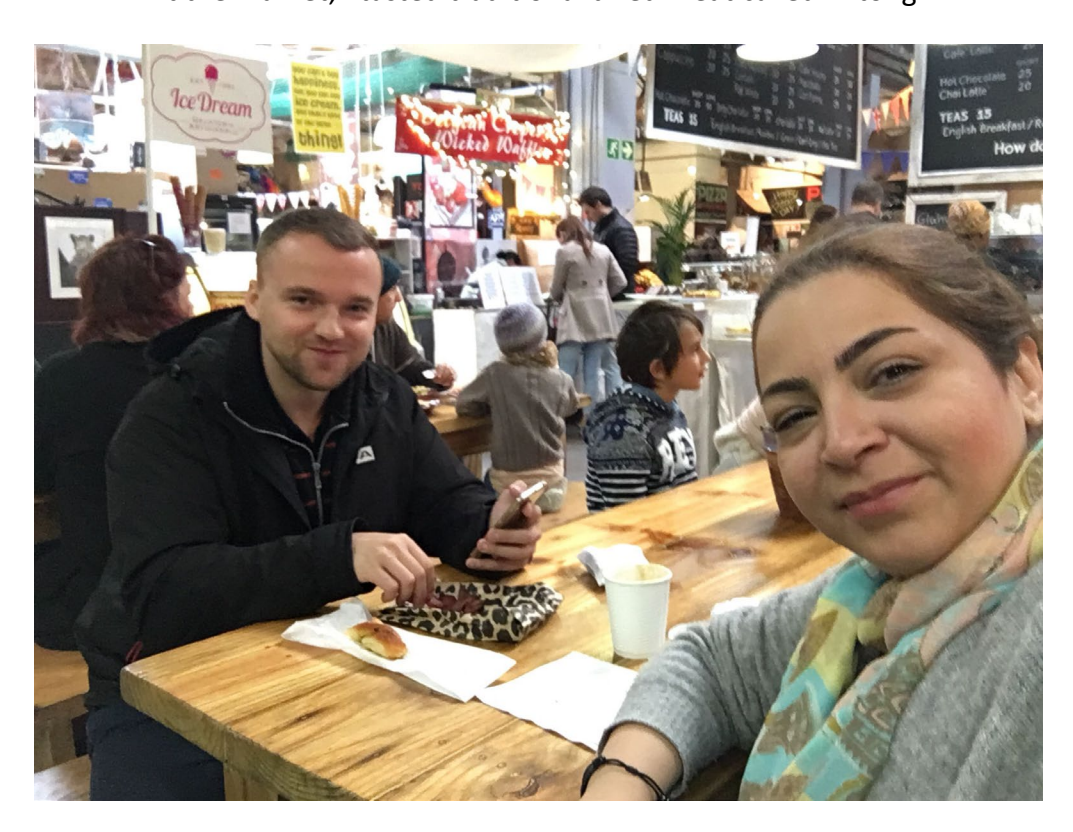
That's inside the market.