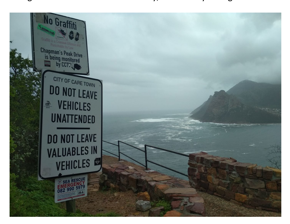
Maybe you've heard<sup>26</sup> there's a high rate of crime in South Africa . This sign warned us of that.