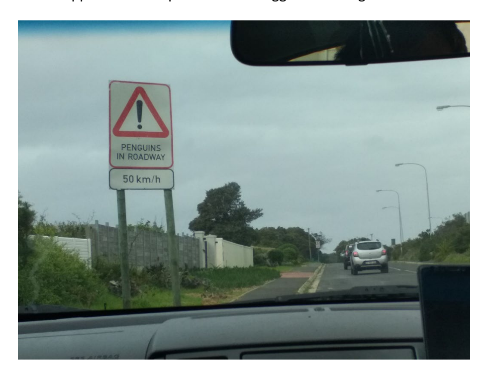
Then we arrived in<sup>27</sup> Simon's Town. There's a large colony of African penguins (Boulders Beach)! This sign warned us of<sup>28</sup> them!