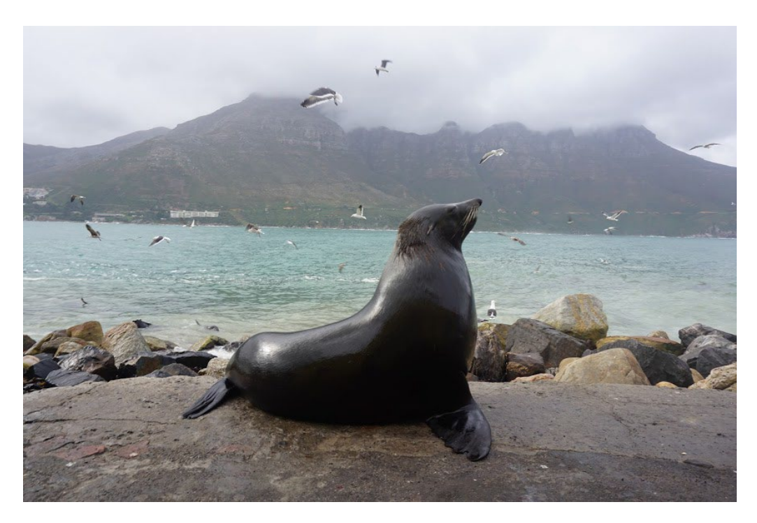
And we could see this one very close \ensuremath{\mathfrak{e}} .