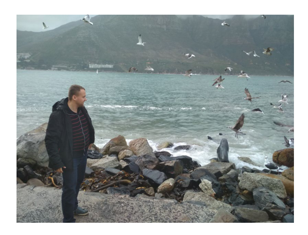
Then, we went to another ^{22} market on the coast in Hout Bay where we could see seals! There's one in the picture. Can you see it? ^{\ensuremath{\circlearrowleft}}