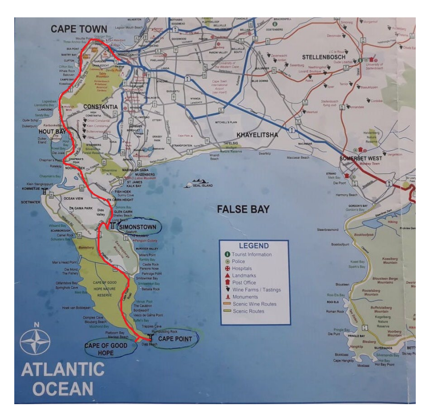
The red line stands for<sup>20</sup> the plan of our trip around Cape Town 2 .

Akshaya, the Indian girl, joined us as well as Azadeh, an Iranian woman staying somewhere else. Nick knew Azadech via Couchsurfing, too. So the next day, we hit the road!