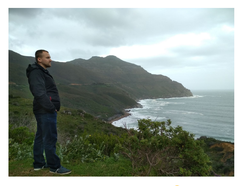
The rocks were just pictourious<sup>25</sup>! 🙂