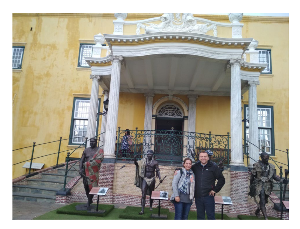
Then we went to the Castle of Good Hope, where we learned about the history of South Africa .