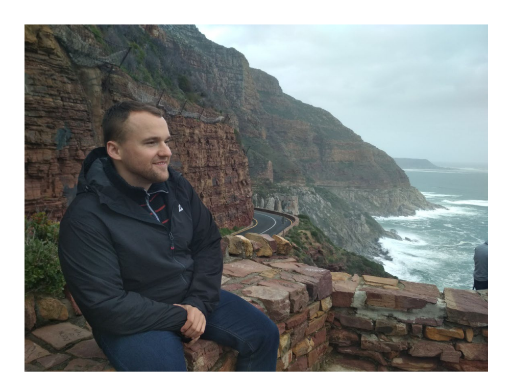
As we were going along the coast to the south, we often saw beautiful rocks around! Of course, we had to stop to take pictures of them! \ensuremath{\ensuremath{\mathfrak{C}}}