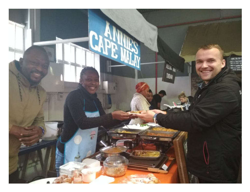
These cooks were so lovely that I had to take a picture of them! 🐸