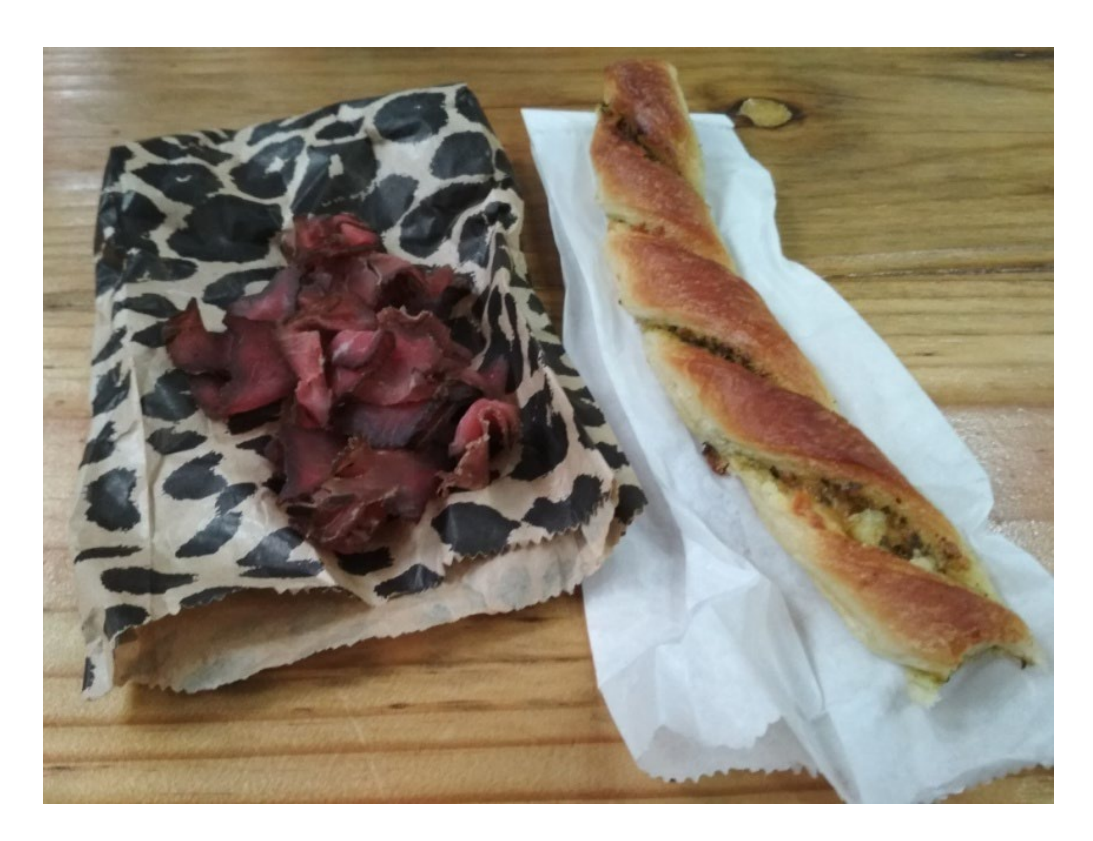
At the market, I tasted traditional dried meat called Biltong.