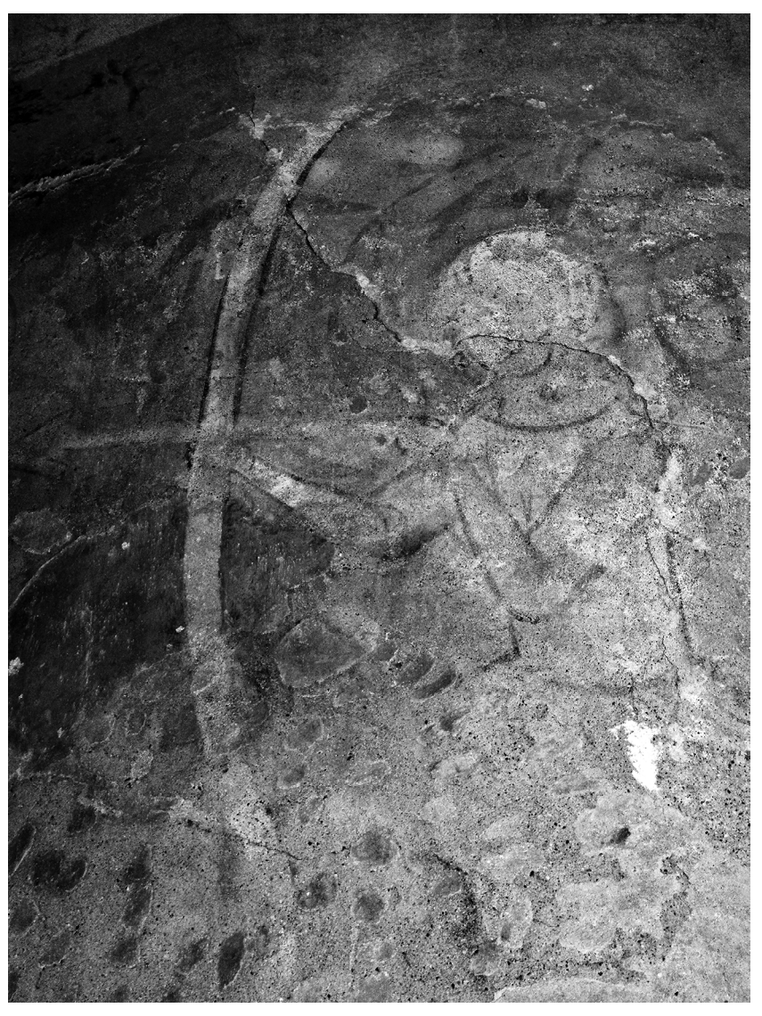
A unique painting of a left-handed archer, the only in the world, discovered at castle Houska in the Czech Republic